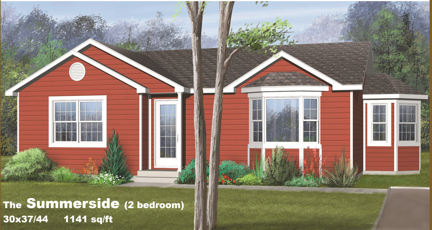
The Summerside (2 bedroom)